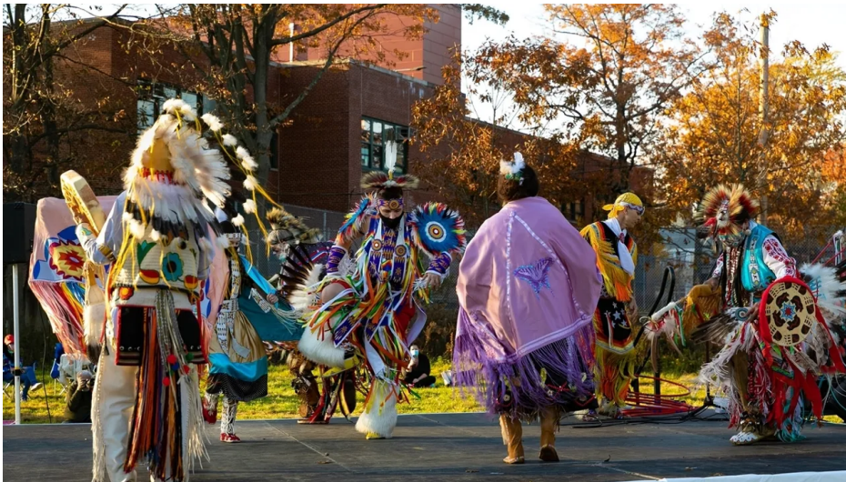
MCC Thunderbird Powwow Unites Native Tribes for Cultural Showcase on March 9

The Mesa Community College (MCC) Thunderbird Powwow, scheduled for March 9, is set to be a vibrant celebration of Native American culture, organized by the American Indian Institute and the Inter-Tribal Student Organization. This event, which brings together various tribes, will feature traditional dancing, art, crafts, singing, and food at the Southern and Dobson campus, marking an important cultural gathering for the second year in a row since the hiatus caused by the COVID-19 pandemic.